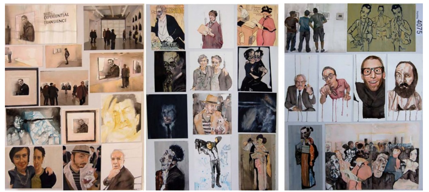
AP Art Ideas: This is an example of a tried and true portraiture theme being approached in a highly original and innovative way, exploring the interaction between artist and viewer.

Finally, ensure that the topic you choose is something that you really care about: something that can sustain your interest for a year. If you have more than one topic left on your list, pick the thing that you care about the most.