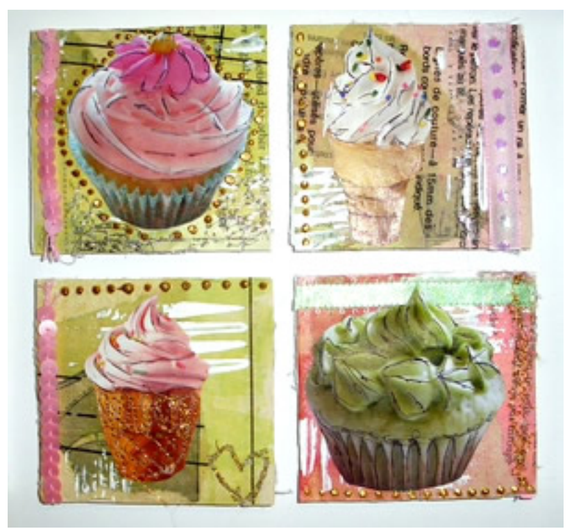
Sometimes even 'pretty' objects can be explored in a contemporary and innovative way, as in this appealing mixed media cupcake work by a student from Sir William Ramsay School.

In order to create artworks, you will need access to high quality imagery. For example, if you are exploring the way in which humans kill animals in order to consume their meat, access to the inside of a butchery or abattoir/freezing works is likely to be essential. Reliance on photographs taken by others is unacceptable. No matter how awesome a theme appears, if you are unable to explore any aspect of it firsthand, you will not be able to do the topic justice. Remember also that it is likely you will need to return to your source imagery several times during the AP Art course, so a submission based upon a particular plant that only blooms for a couple of weeks out of the year, or a view of your village during a rare winter snow storm, is very risky. The ideal AP Art subject is one that you can physically return to, whenever you need – to draw, photograph or to experience firsthand. Eliminate those which do not meet this criteria.