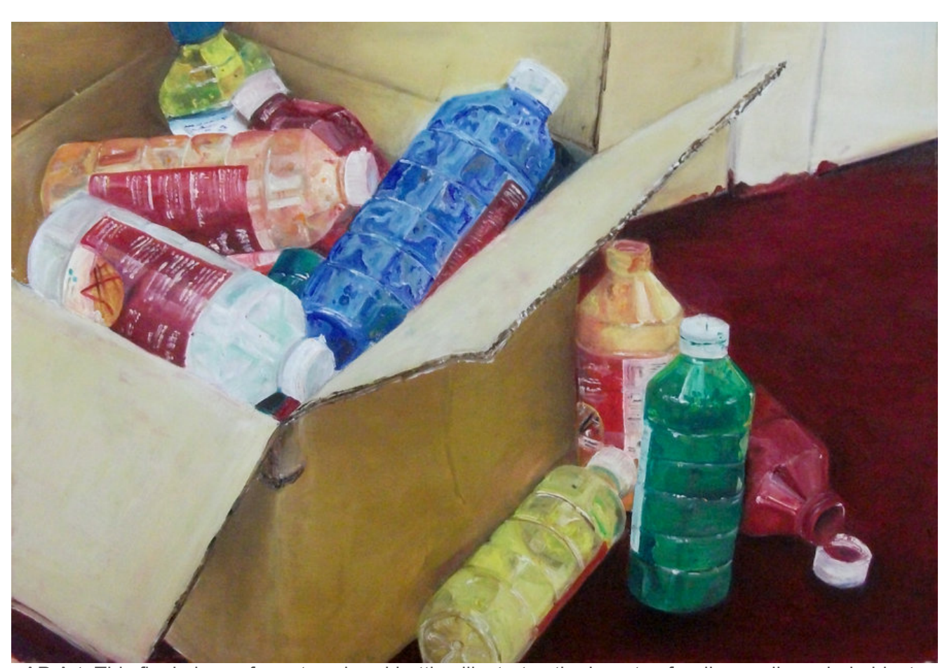
AP Art: This final piece of empty colored bottles illustrates the beauty of ordinary, discarded objects.

that which others have discarded or forgotten. This does not mean, of course, that any old thing is suitable for your AP Art topic. Some scenes are genuinely unattractive and unsuitable visually. Certain object combinations (due to their particular shapes, colors or textures) are extremely difficult to compose in a pleasing way. Similarly, some items – particularly disproportionate drawings or designs by others – are very challenging for a high school student to replicate. A drawing, for example, of a doll that is proportioned unusually, may appear to be an inaccurate, badly proportioned drawing of an ordinary doll. In other words, the examiner may not realize that the doll is proportioned badly – they may think you simply cannot draw. (If you find ascertaining the aesthetic potential of your ideas difficult, discuss this further with your art teacher.