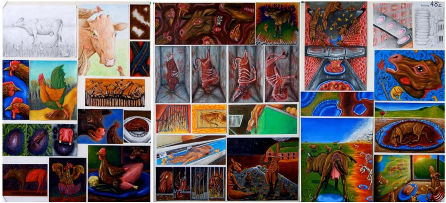
AP Art Ideas: This student has used provocative imagery to explore the contentious issues surrounding human consumption of animal flesh.