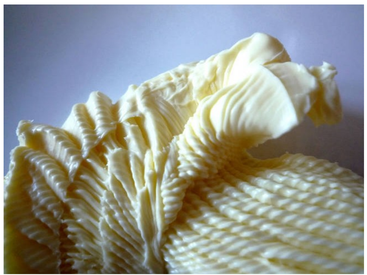
AP Art Ideas: This accidental swirl of butter creates the immediate potential for aesthetic exploration: a moment found in what seems to be the ordinary and mundane.

The next topics to eliminate are those, which are common or over-done. It doesn't matter if some other people have explored the same topic before you... With the millions of people in the world, it is highly unlikely that you will be the only one to explore a particular theme (this doesn't matter – you can learn from them...and no one will make art exactly like you), but, as mentioned above, if EVERYONE is doing it – if it is a topic that the examiners have seen a hundred times before, you should think carefully about whether you have something sufficiently new and original to say about it.